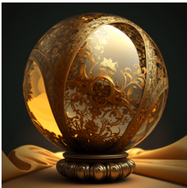
I think this was luminous golden globe with intricate details lit from below.