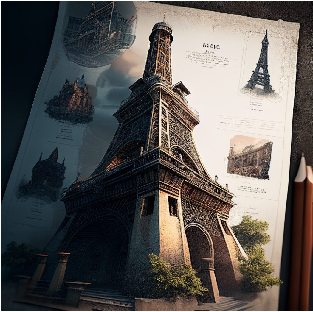
Steampunk Schematic of the Eiffel Tower