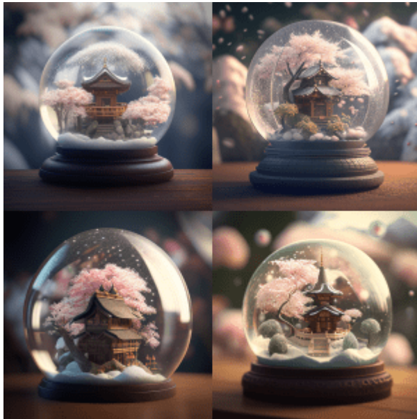
Snow globe with Japanese temple.

Where did the day go? Oh, right. ChatGPT can create some really good prompts for MidJourney when set up the right way. Here are a few of my favourites from today. I want to learn how to do better landscapes. But I am loving the schematics and blueprints.