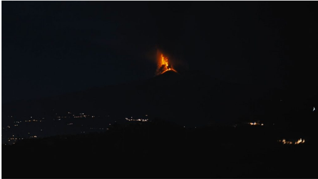
The White Lotus Season 2 - Mount Aetna spewing lava

And TIL that the writer, Mike White, was on the US reality tv show Survivor.